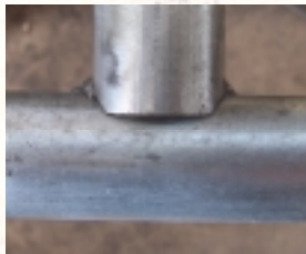
Notched joint prior to welding

Once the panels have been MIG welded all of the joints are wire brushed to remove weld residue and spatter and then painted with 'cold galv' to prevent corrosion.