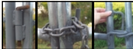
Left: Drop Pin Centre: Fixed Chain Right: Fixed sliding drop

the panel. Panels can be made with a full mesh insert, or with just the bottom half mesh and the top half rails. This combo panel weighs slightly less than a full mesh panel.