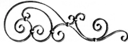
Art 9-02 225 x 800 mm, 6.000 kg