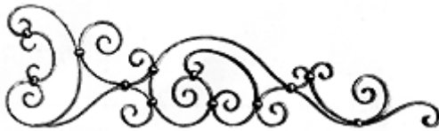
Art 9-03 225 x 800 mm, 6.000 kg