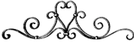
Art 9-01 225 x 800 mm, 6.000 kg