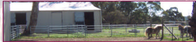
Fixed Miniature Pony Yards

When designing yards the wall thickness and diameter of the rails can be varied, as well as the length and height of the rails. Yards can be made fixed or with portable panels.