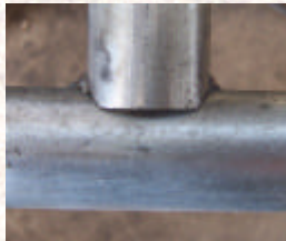
Notched joint prior to weld-

Farmweld products are constructed from quality hot dipped galvanised pipe. Horses are heavy animals which can put a lot of stress on yards and gates. Because of this we accurately measure and take the extra time to notch all the welded joints. This is done to provide a cleaner looking and stronger joint with double the welds of conventional squashed joints. Loads are distributed more widely and evenly within the structure and also provides a smoother joint with less chance of animals catching on protrusions.