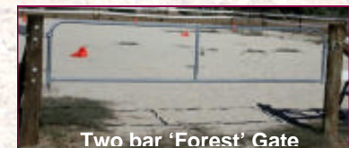
Two bar 'Forest' Gate